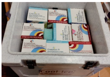
Gardasil only = 9 boxes