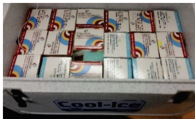
Gardasil = 18 boxes