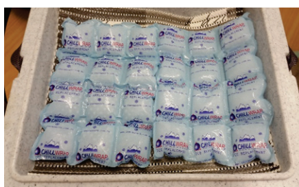
22L packed chilly bin