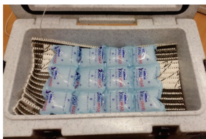
13L packed chilly bin