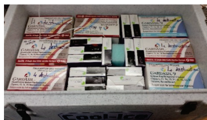
equal Boostrix & Gardasil = 14 boxes of each

Note: gap in 41L chilly bin photo is because not enough boxes of vaccine were available to fill the gap.