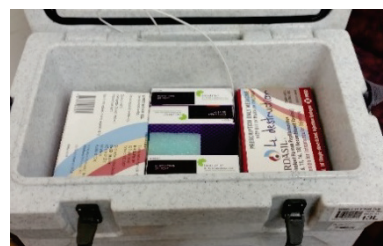
equal Boostrix & Gardasil = 4 boxes of each