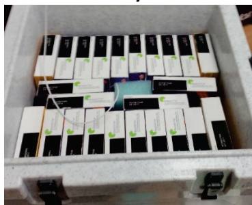
Boostrix only = 24 boxes