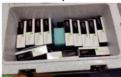
Boostrix only = 12 boxes