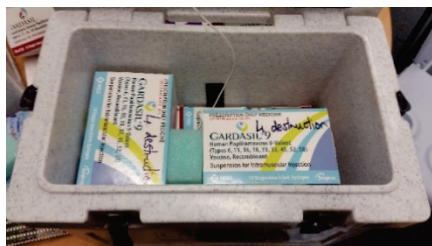
Gardasil only = 5 boxes