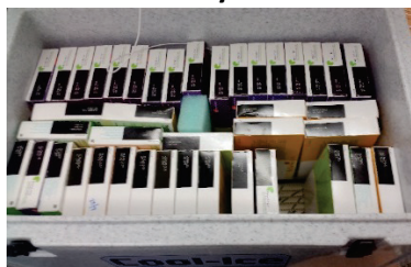
Boostrix only = 43 boxes