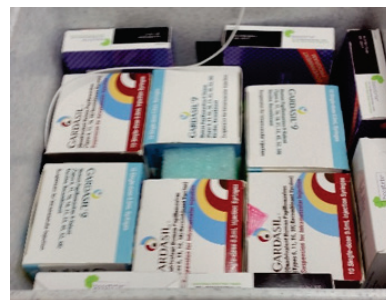
equal Boostrix & Gardasil = 6 boxes of each