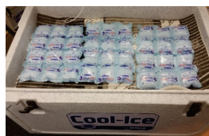
41L packed chilly bin